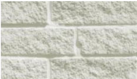
Hillstone Straight-edged brokenface