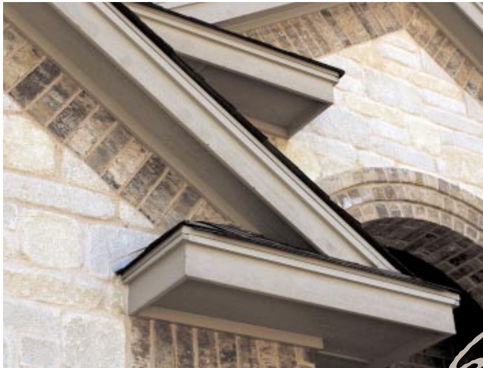
Ashlar accented by Winslow Brick

More and more homeowners are loving the dramatic, natural look they get from Hanson Rock series. Is it the variety of sizes and options they can choose from? Is it because they can use it throughout the home, or as accents with other brick? Is it because it's easier to install and less expensive than natural stone? Or is it because they save on energy costs and maintenance while profiting from their investment in Rock Series products? No matter how you look at it, the answer is yes.