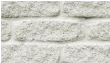
River Rock Tumbled uniform lengths