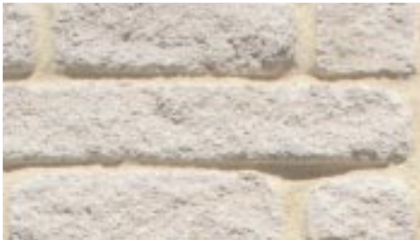
Texas Stone Tumbled varying lengths