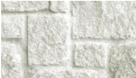
Ashlar Varying sizes, available in tumbled or straight edges